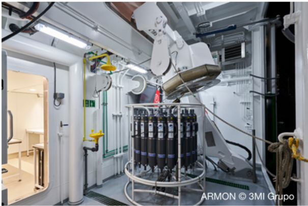
ARMON © 3MI Grupo